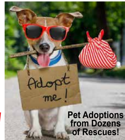
Pet Adoptions from Dozens of Rescues!