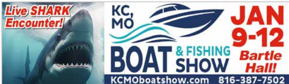
Billboard campaign artwork